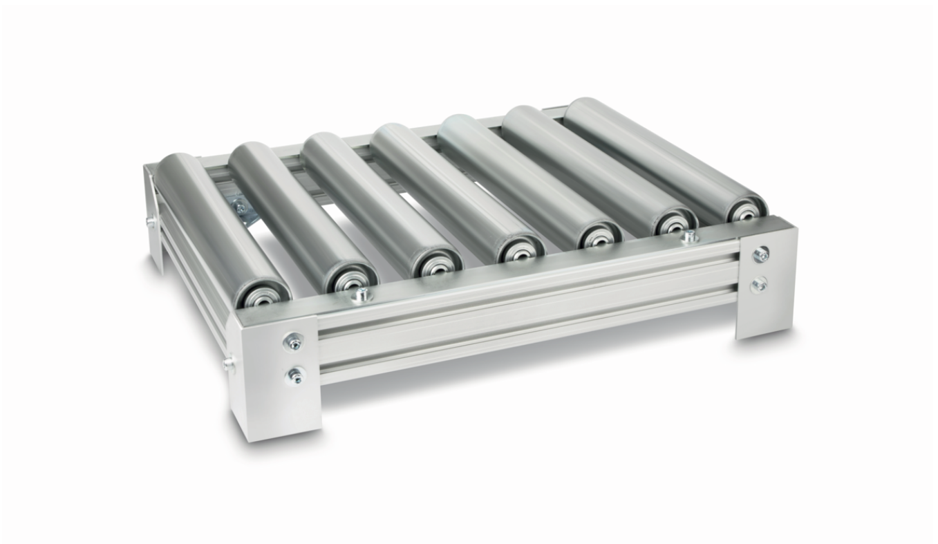
Roller Conveyor KERN YRO-01